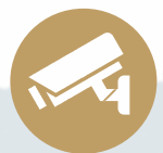
CCTV & Intercom Facility For 24*7 Security