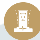
Earthquake Resistant RCC Structure