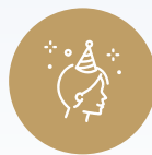
Open Party Deck