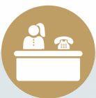
Impressive Entrance Lobby