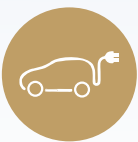
Car Charging Point